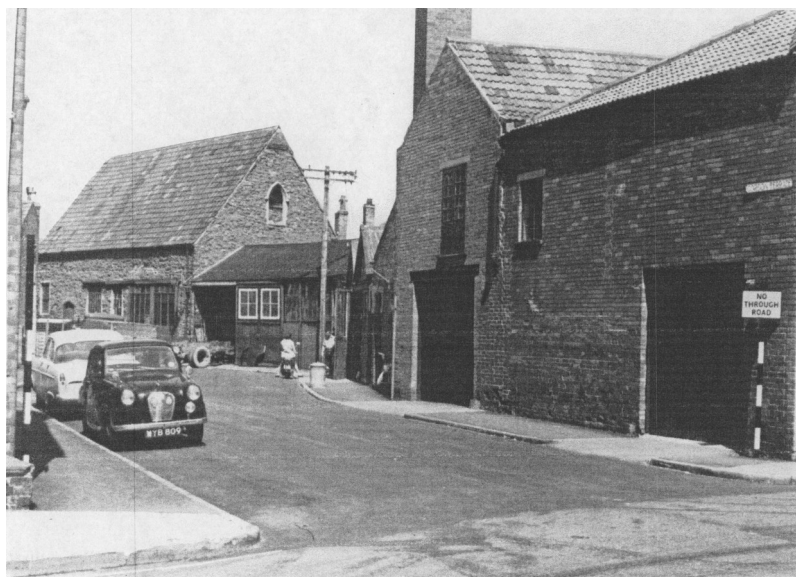
Seen from Gordon Terrace