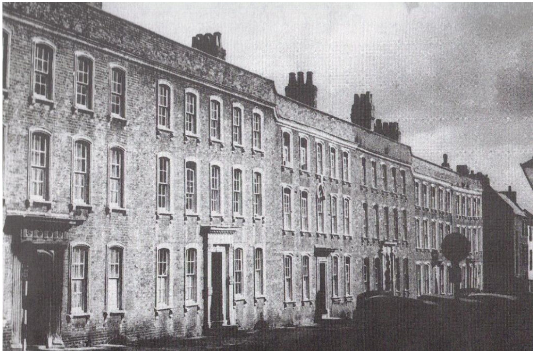
Fig 1 Houses at the head of Chandos Street (now called Castle street, Bridgwater.