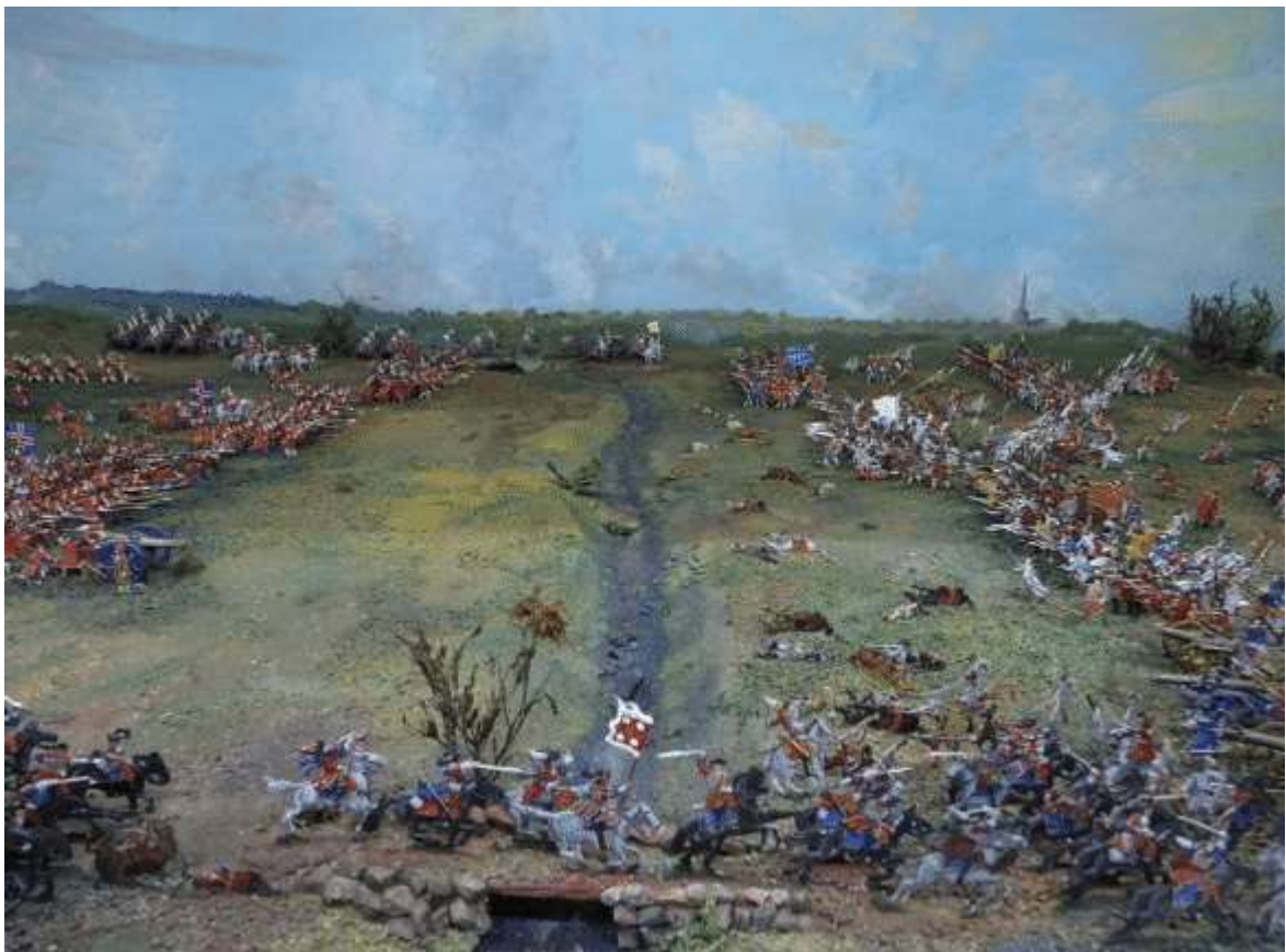
Photograph of part of the Diorama of the Battle

The scene in the foreground shows the King's troops pursuing the rebels over Bussex Rhyne, and Monmouth escaping to the right