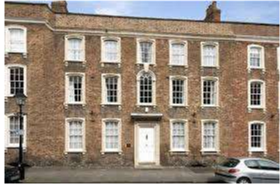
Castle Street, built by the Duke of Chandos

In the early C18 the Duke of Chandos tried to develop new industries – a glass works, cloth making and ship-building, etc,