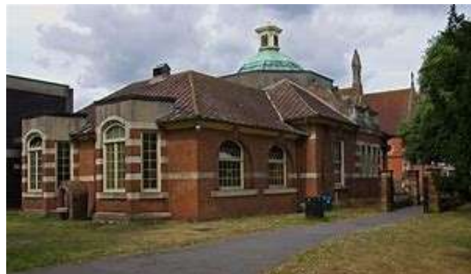
The rear of the building

It is a Grade II listed building. At the rear of the building is a public drinking fountain.