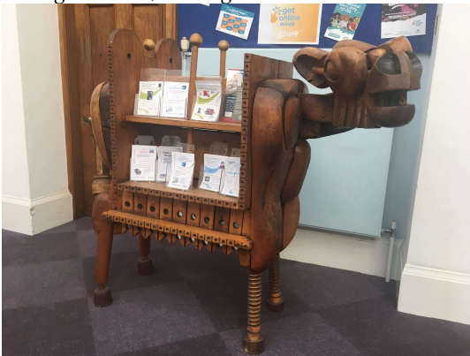
Caxton, the book horse