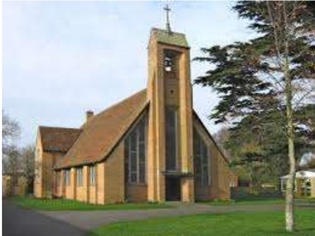
Holy Trinity, Hamp.

demolished in 1963, but the churchyard retained as an open space.