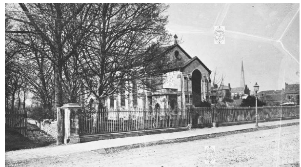
Holy Trinity, Taunton Road

From the start of the C19, Bridgewater's population grew from 3634 in 1801 to 7807 in 1831 causing a strain on the accommodation at St Mary's. A new church, Holy Trinity was built in 1840, becoming a District Chapelry the following year.