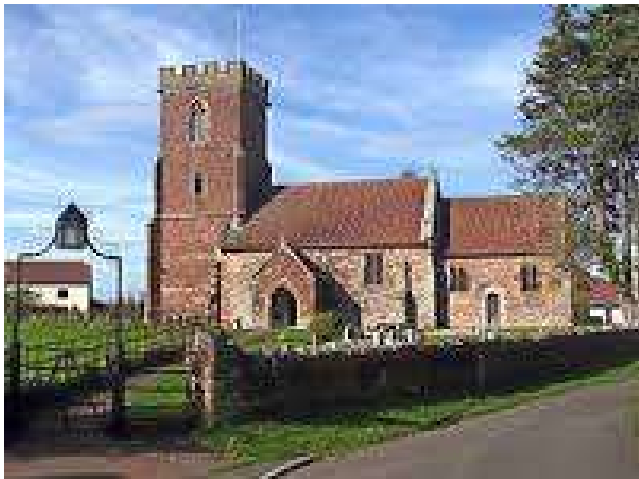
Chilton Trinity church.

Durleigh church dates from the twelfth century, and was described as a chapelry. In 1976 it was united with Saint Mary's and Durleigh, but in more recent times has been united with Holy Trinity Hamp.