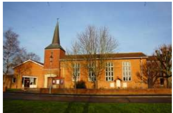
St Francis of Assisi, Saxon Green

After World War 2, more housing was built eastwards beyond the railway, to cater for increased population and a district church, Saint Francis of Assisi, was built at Saxon Green in 1960. It became a parish in its own right in 1965.