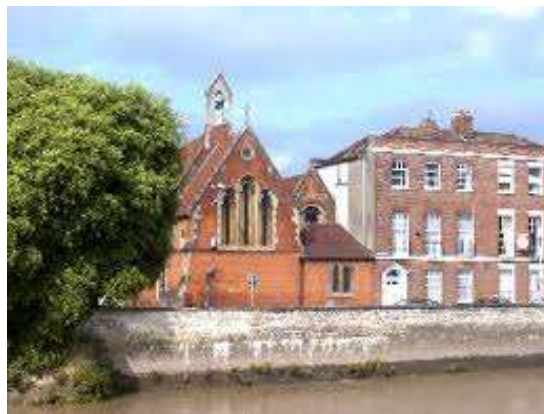
Saint Joseph's Church

A new Catholic chapel, dedicated to Saint Joseph was built in Binford Place in 1882, and extended in 1982.