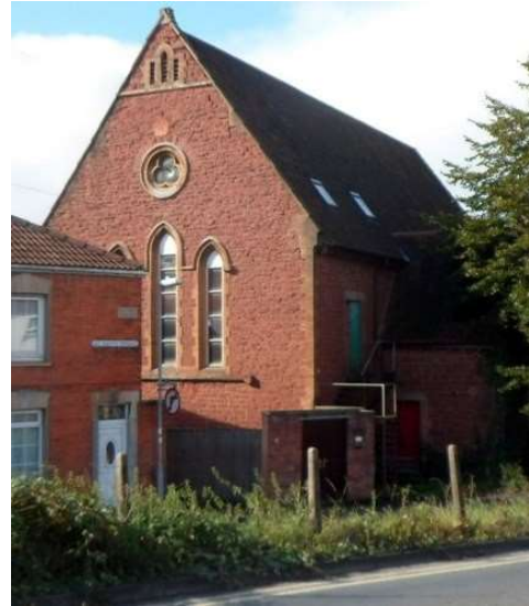
All Saints, Westonzoyland Road

In 1882 St John's opened a mission church, All Saints, off Westonzoyland Road, now used as a youth club.