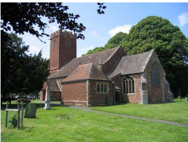
Saint George's, Wembdon

Saint George's Wembdon dates from the twelfth century. The parish includes a number of the suburbs of Bridgwater to the north west of the town.