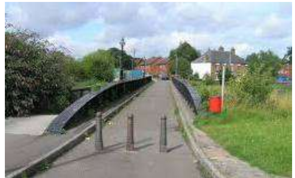
The pedestrianised telescopic bridge

The docks branch closed on 2 January 1967. The mechanism of the telescopic bridge was partially dismantled, and later the bridge was utilised as a single track road controlled by traffic lights, before being pedestrianised upon construction of the Chandos Bridge.