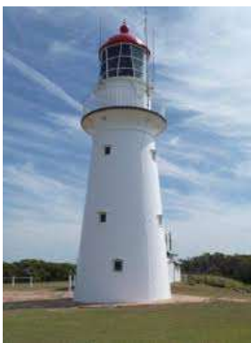
Bustard Head Lighthouse, Queensland, Australia. Opened 1869

The firm was responsible for three bridges over the Thames, railway signalling work and prefabricated lighthouses for Watchet, South Wales and Australia. The site has been redeveloped for other industrial use.