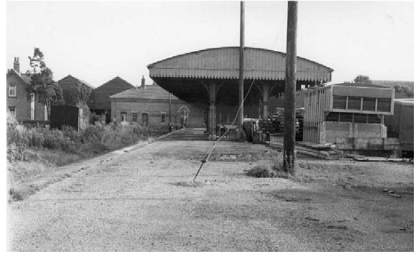
Bridgwater North station before demolition

The Bridgwater terminus was used by British Road Services (BRS) until demolished when Sainsbury's supermarket was built.