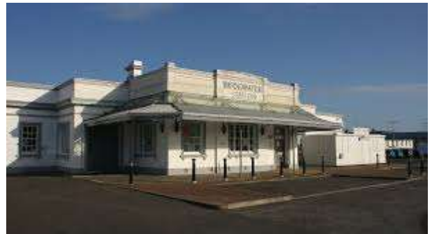
Bridgwater railway station

The line was managed by the GWR until nationalisation and thereafter by British Rail. Now there are local trains hourly to Bristol and Taunton where other connections can be made, and there are two trains daily to and from London.