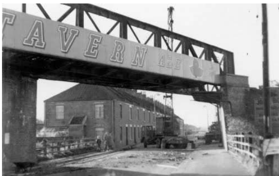
The demolition of the bridge over Bristol Road

Passenger traffic ceased on 29 November 1952 and goods on 1 October 1954.