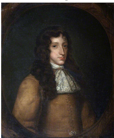
Sir Edmund Wyndham, Royalist governor