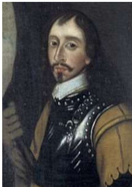
Sir Edward Massey

Troops remained in the town, which was used as a base for the expedition to Ireland.