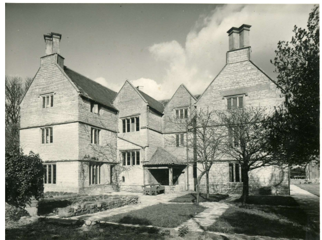
Sydenham House, Bath Road

In the fire-storm that followed many of the buildings in the town were burnt down. Blake House, (the museum), the Mill, Saint Mary's church and the old Vicarage in St Mary Street are among the few survivors.