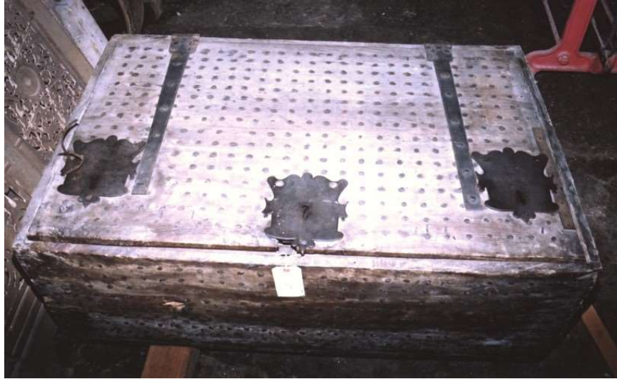
The Corporation Chest, possibly Reclaimed from the Hospital

the master to improve the security of the hospital and its buildings. A “chest with three locks and three keys” is to be obtained for the storage of documents – perhaps this was later passed over to the townspeople, and is today present in the Blake Museum?