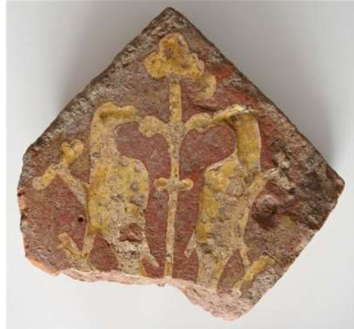
Medieval tile found on the site of St John's Hospital Blake Museum BWRAB : 1959/32

A Purbeck marble coffin with finely ashlared sides covered with a slab with a delicate foliate cross in relief lying in the middle tomb recess, south aisle, St Mary's church. The small incised Lias slab on top is from a separate tomb.