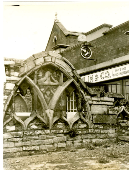
Believed to be from St John's Hospital. It was destroyed in 1960 when they tried to remove it for the Monmouth Street road widening. Parts of it are in the museum..

Blake Museum is owned by Bridgwater Town Council and managed by volunteers from the Friends of Blake Museum. (Registered Charity 1099815) www.bridgwatermuseum.org.uk