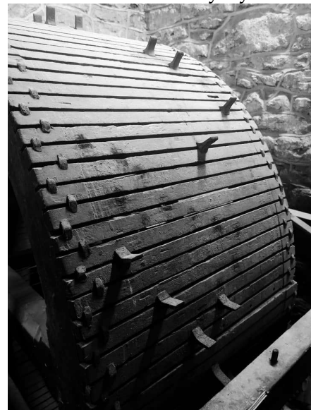
Early C19 Chime barrel

quarters (the Westminster) as well as the hours, but this is now silenced. It has a compensating pendulum, eight feet long, with a sweep of three feet, and weighing 5 cwt. The weights are three in number, and are much heavier than the pendulum. The clock-dial is fixed at the top of the tower, and faces direct east, the hands, one of which measures 3 feet 6 inches, being moved by rods connected with the works below. The white face is about 24 feet in circumference, was originally illuminated by night, until midnight. Many years since, there was a one-handed dial facing south, for the benefit of the Vicar, the vicarage being in St. Mary-street. Traces of the aperture in the tower may still be seen. The clock was once wound weekly, by hand, but it is now done automatically by electricity.