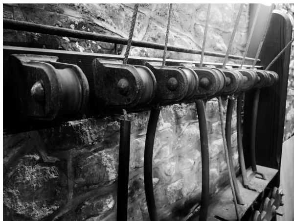
The Ellacombe carrillon

probably dates from the early C19. The machinery was wound up daily. Later, an Ellacombe Carillon was fitted, where simple tunes could be played manually by one person. This was used into the early 1980s.