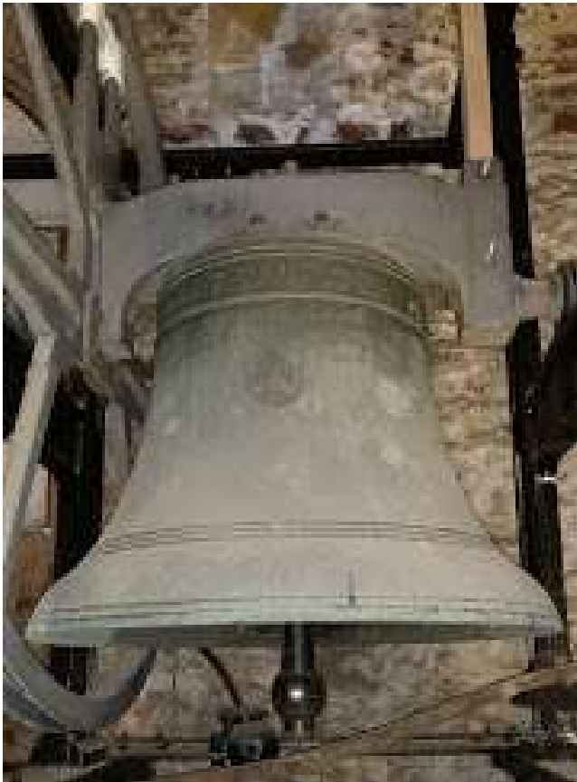
No 5 bell, G. Cast 1634, and recast 1899

No medieval bell survives in St Mary's, but quite a lot is known about them, mostly through the records kept by the churchwardens then. A document of 1318 records how money was raised in the town for a new bell. It was collected from the parishioners and visitors and the sale of a collection of hardware, pots and pans, etc. The medieval churchwardens' accounts of St Mary's show there were three bells in the fourteenth and fifteenth centuries, the Great, Second, and Little. One was near the north porch and two were in the tower. There were frequent payments for new baldricks, (the leather tackle by which bell clappers