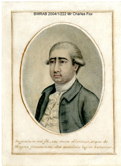
Image to be added Portrait of Charles James Fox