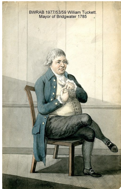
William Tuckett, Mayor of Bridgwater, 1785